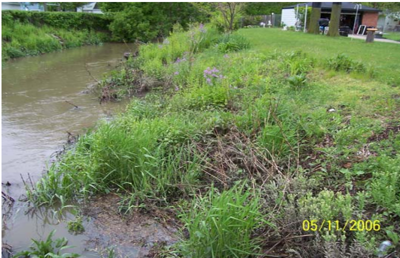
6.3 NBEC D from Banner Street pedestrian foot bridge in Dearborn Heights, looking upstream. Silt deposition observed about six inches above flood levels.