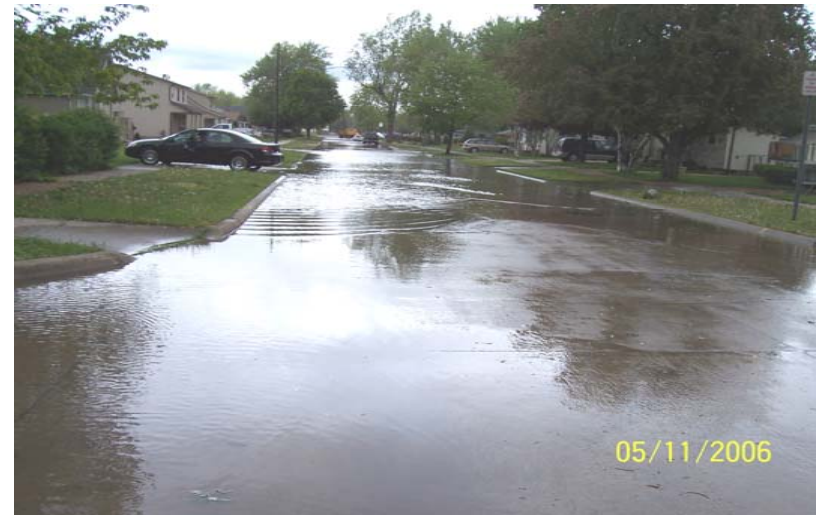
3.4 Street flooding on Jackson Avenue south of Van Born Road and west of Pelham Road in Taylor, looking south. Note flooding near top of curbs.