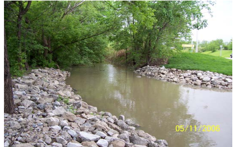
3.2 Reeck Drain just east of Pelham Road in Allen Park, looking downstream. Note drain is near bank-full conditions.