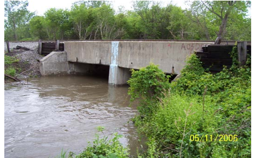
2.2 Downstream face of railroad bridge crossing near confluence with Reek Drain in Allen Park, looking upstream.