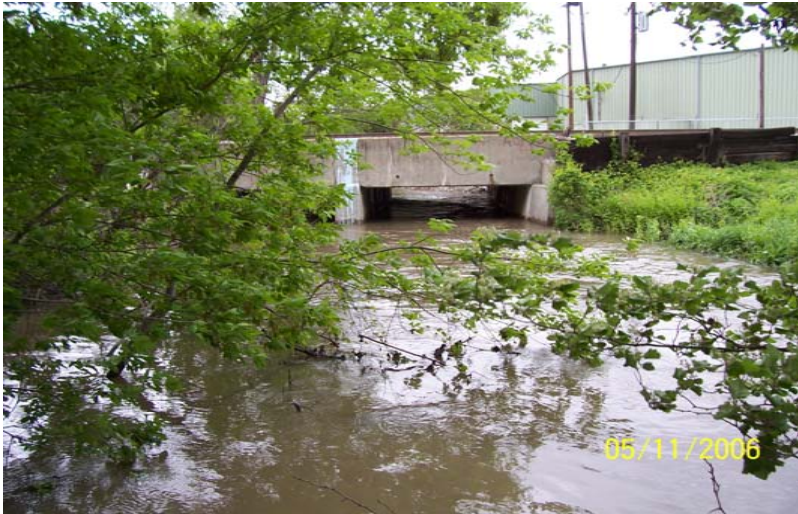
2.1 Downstream face of railroad bridge crossing near confluence with Reek Drain in Allen Park, looking upstream.