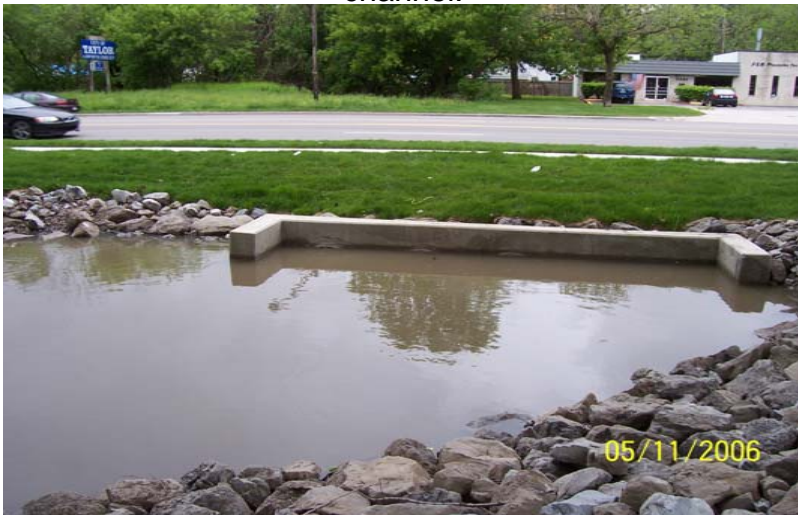
3.3 Reeck Drain culvert under Pelham Road in Allen Park, looking upstream. Note flood level is about six inches below the top of headwall.