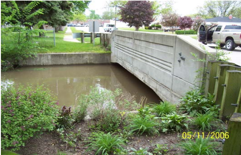
6.1 Monroe Street bridge crossing over the NBEC D near Hanover Avenue in Dearborn Heights, looking south. High water marks on bridge abutments were about six inches higher than flood levels.