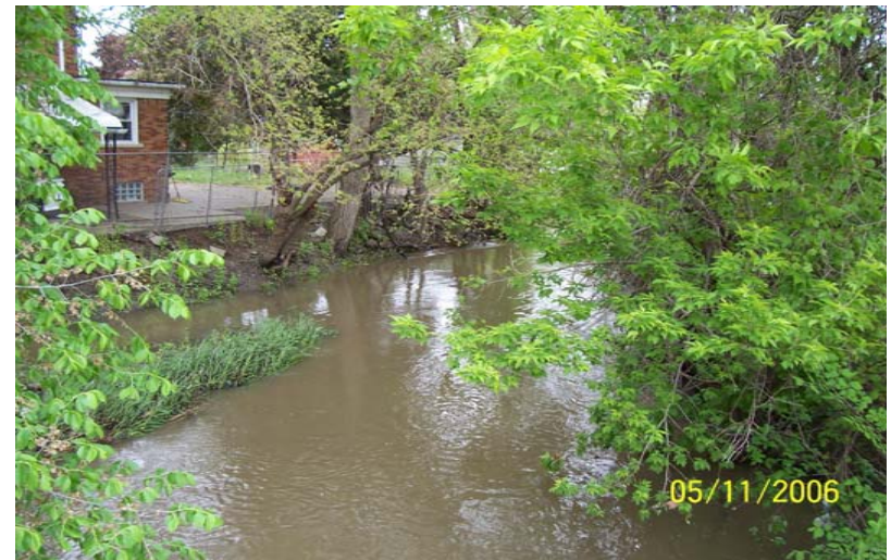
5.4 NBECD near intersection of Monroe Street and Hanover Avenue in Dearborn Heights, looking downstream. Silt deposition observed about six inches above flood levels.