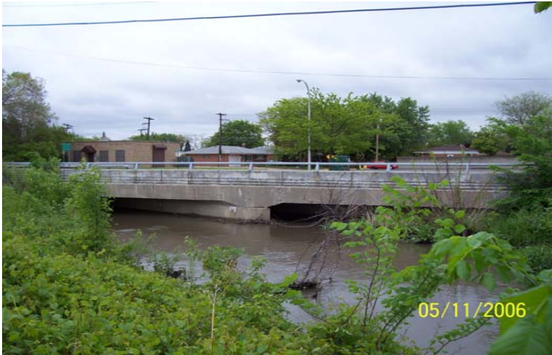
1.1 Upstream face of Allen Road bridge from Thunderbowl Lanes bowling alley in Allen Park, looking downstream.