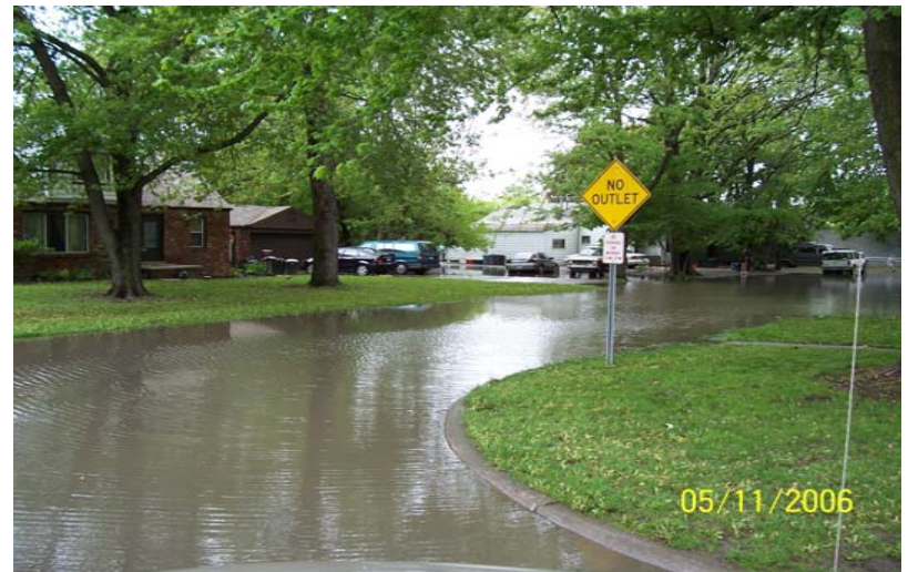
4.4 Ziegler Road near intersection with Avalon Road south of Van Born Road and west of Pelham Road in Taylor, looking southeast. Note flooding into front lawns and over driveway.