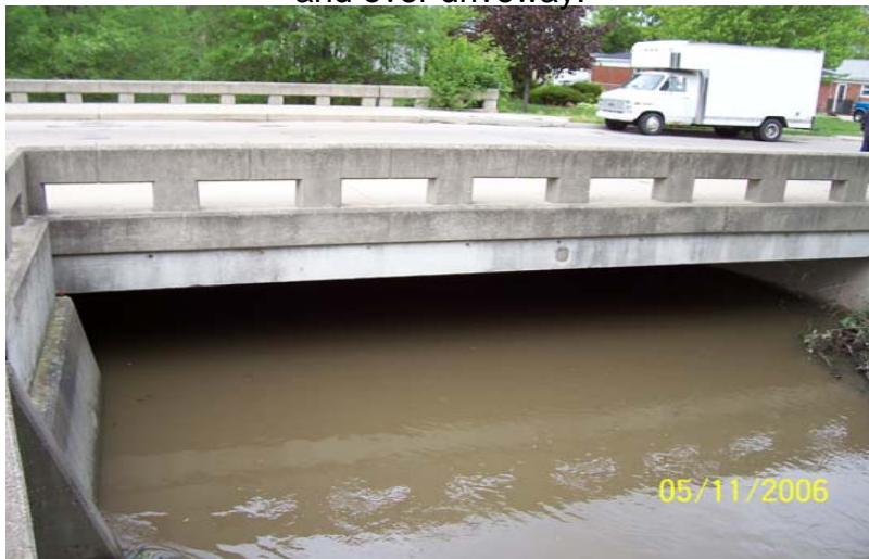
5.3 Monroe Street bridge crossing over the NBECD in Dearborn Heights, looking upstream. Note flood levels were about one foot below low chord of bridge.