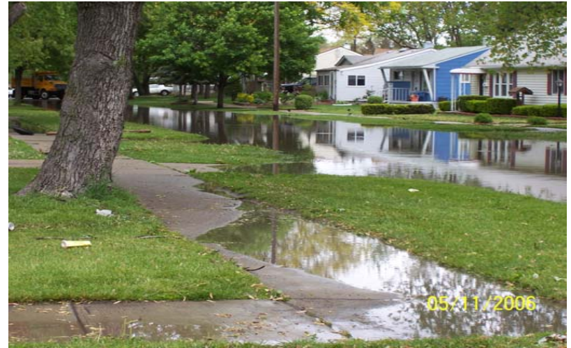
4.1 Ziegler Street near intersection with Avalon Street south of Van Born Road and west of Pelham Road in Taylor, looking northeast. Note flooding is well above top of curbs and over sidewalks into front lawns.