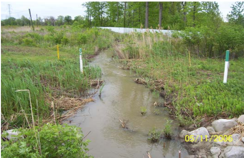
2.3 Reek Drain east of Southfield Freeway behind commercial property in Allen Park, looking downstream. Note drain is near bank-full conditions.