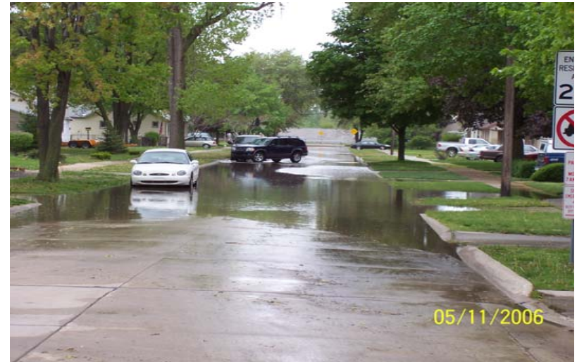
5.2 Mayfair Street south of Van Born Road and west of Pelham Road in Taylor, looking south. Note flood levels near top of curbs.