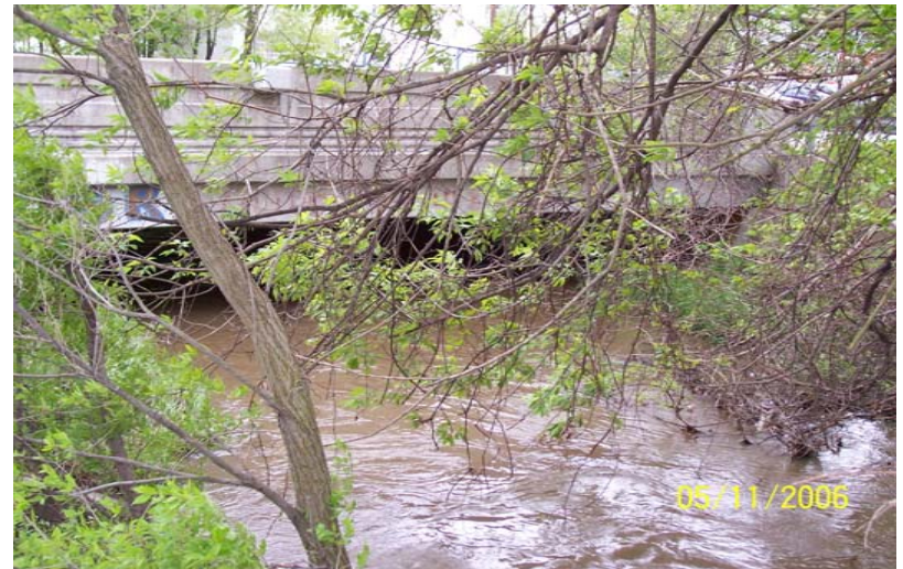
6.4 Upstream face of Beech-Daly Road bridge crossing over the NBEC D in Dearborn Heights near USGS stream gage, looking downstream.