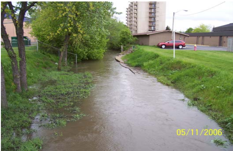
1.3 NBECD from pedestrian foot bridge at Intercity Baptist Church property in Allen Park, looking downstream.