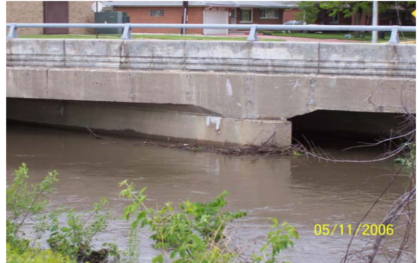
1.2 Upstream face of Allen Road bridge in Allen Park, looking downstream. Note high water marks on bridge pier about six inches above flood levels.