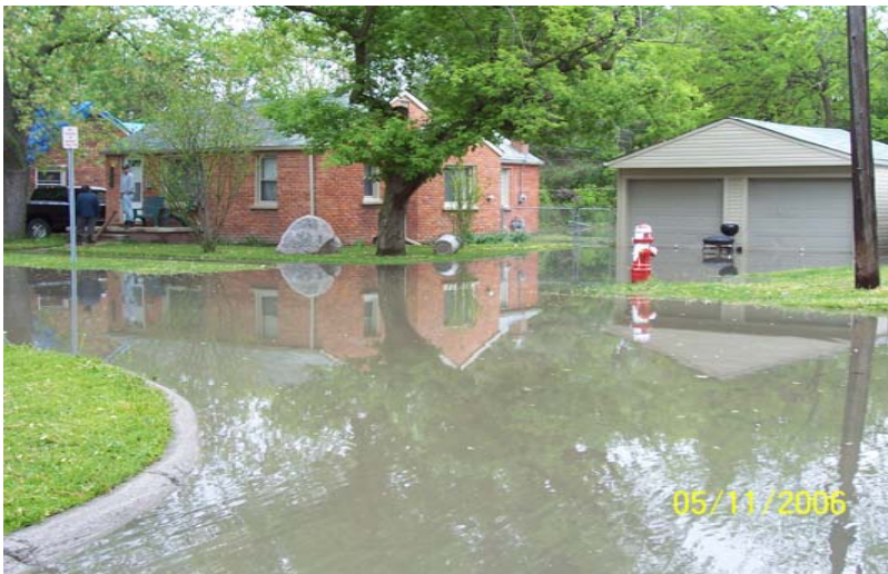
4.1 Ziegler Road near intersection with Avalon Road south of Van Born Road and west of Pelham Road in Taylor, looking northeast. Note flooding over driveway and near brick ledge.