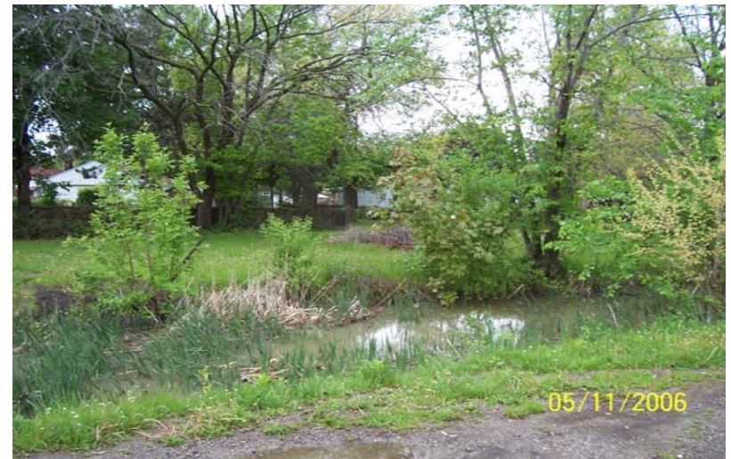
2.4 Reek Drain through Cunningham Park in Allen Park, looking upstream. Note drain is near bank-full conditions and proximity of drain to nearby homes.