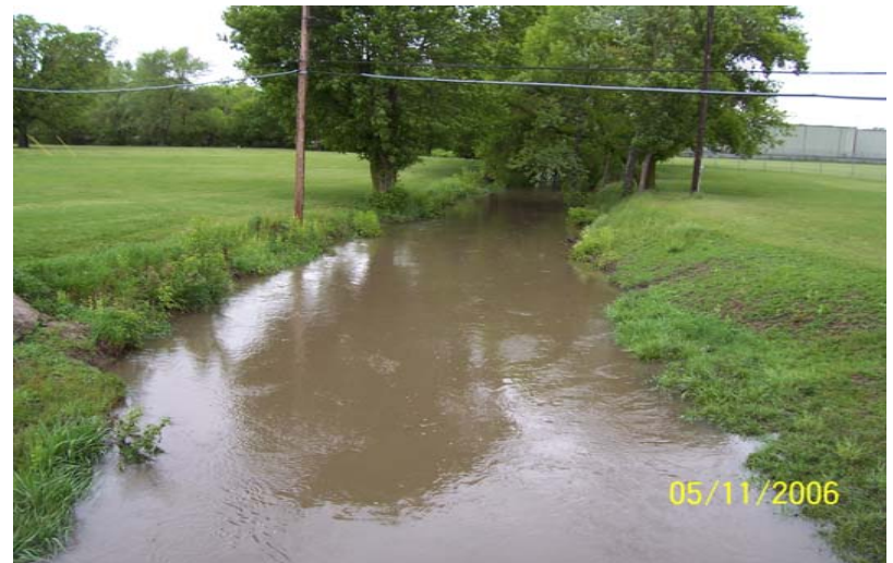
1.4 NBECD from pedestrian foot bridge at Intercity Baptist Church property in Allen Park, looking upstream.