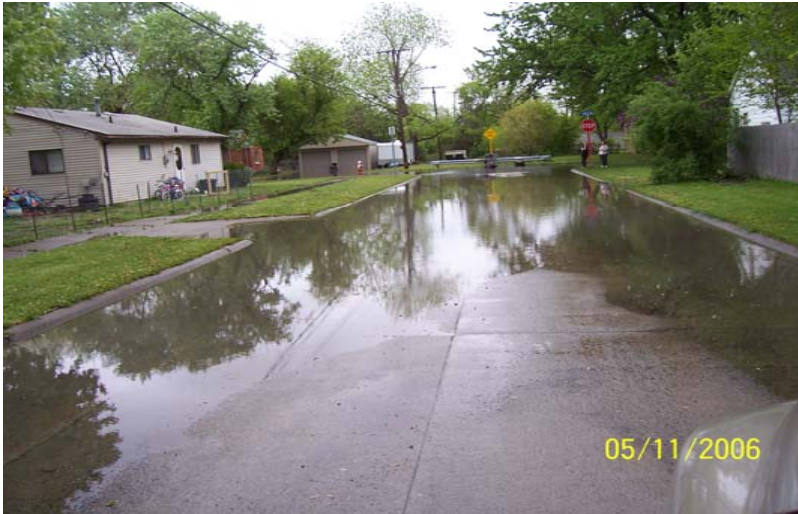
4.1 Avalon Street near Jackson Street south of Van Born Road and west of Pelham Road in Taylor, looking east. Note flooding near top of curbs.