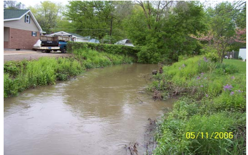
6.2 NBEC D near Jackson Street in Dearborn Heights, looking south. High water marks on bridge abutments were about six inches higher than flood levels.