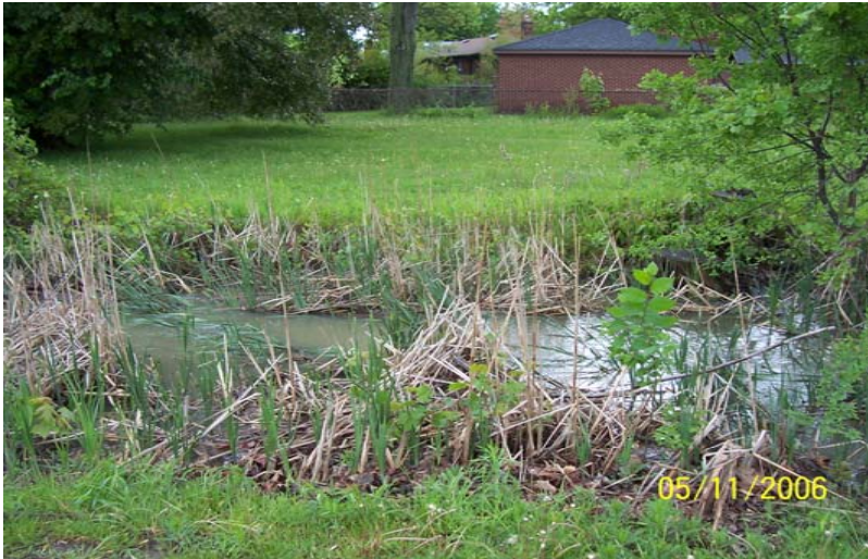
3.1 Reeck Drain in Cunningham Park in Allen Park, looking downstream. Note heavy brush and vegetation present along overbanks and in main channel.